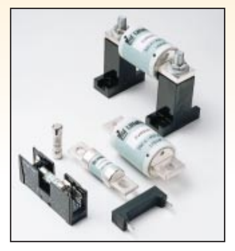
Littelfuse's family of EV Fuses

Littelfuse has introduced its next generation high current EV fuse, the Electrical Vehicle Auxiliary Fuse (EVAX), replacing the CCEV fuse which was introduced last year. The EVAX fuse provides the same electrical function as the CCEV, and its package offers significant safety improvements.